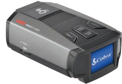
SPX 7700 Maximum Performance Radar/Laser Detector