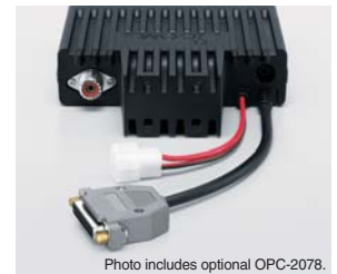
Photo includes optional OPC-2078.

The optional ACC cable allows you to connect with various external devices to control audio output, modulated signal input, remote channel control, horn honk and many more functions. OPC-1939 is a D-SUB 15-pin type and OPC-2078 is a D-SUB 25-pin type.