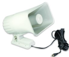
Additional PA Horn Speaker