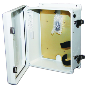
Weatherproof fiberglass housing