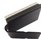
Dual Lock ® Mount

This mount is discreet and very solid for a permanent mounting location. Make sure the adhesive side of the included Dual Lock is securely fastened to the windshield before adding the weight of the detector to it.