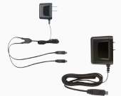
1 x Y Cable and 1 x Single Cable Adaptor