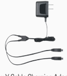
1 x Y Cable Charging Adaptor with Dual Micro-USB Connectors