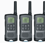
3 x T200 Radios